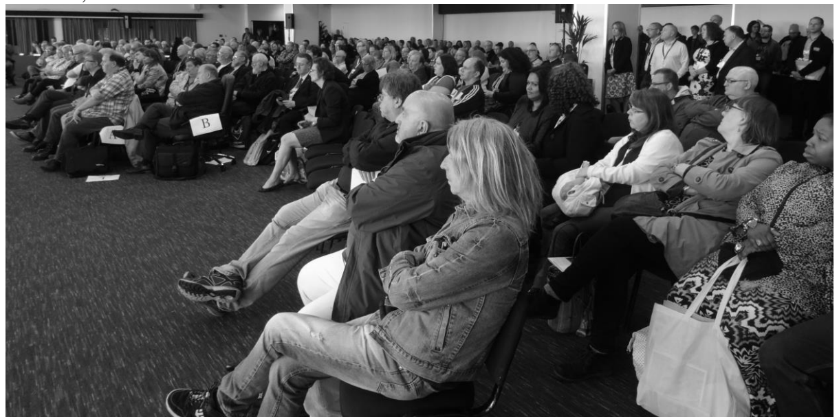
Respectable Turnout at the Fringe Meeting